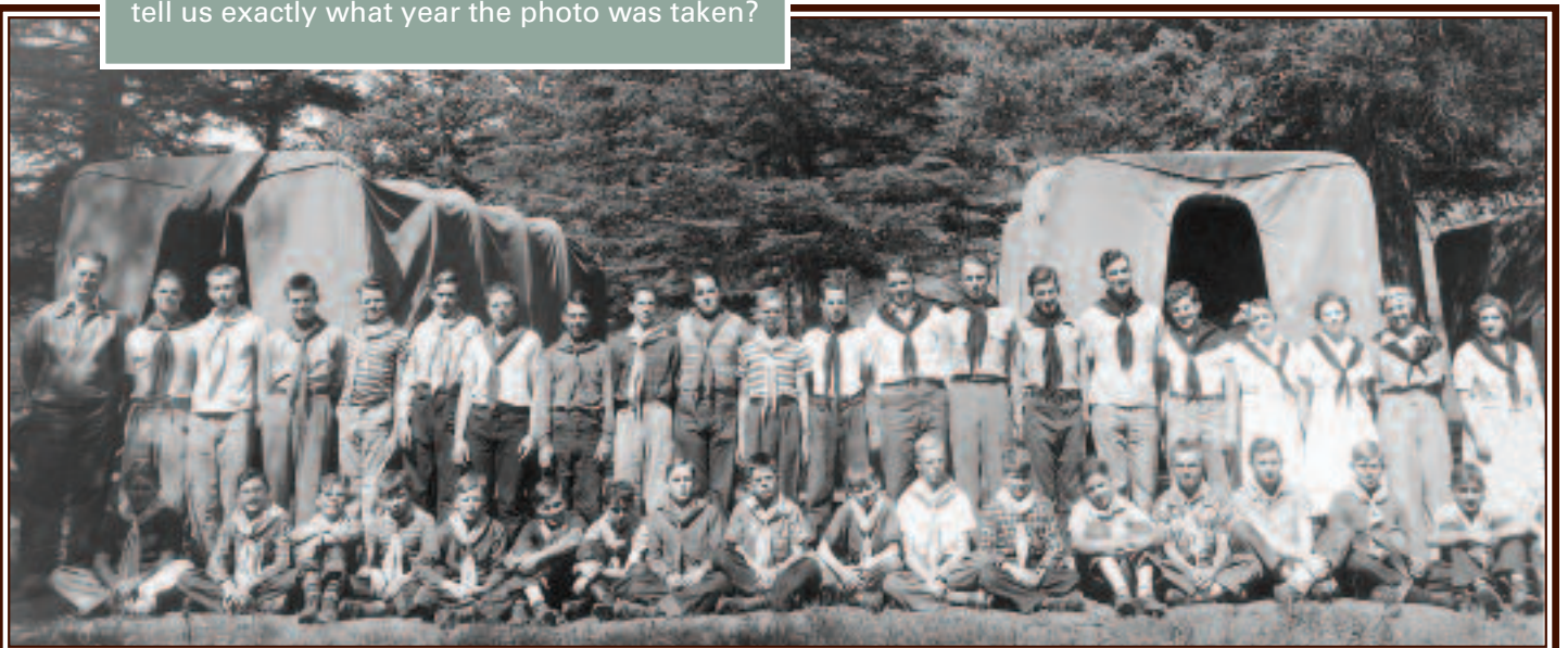
Photo of Boys' Trail's End staff and campers taken prior to the early 60s (old wagons were replaced about 1963). Do you recognize yourself or any relatives ( ! ! ) and can you tell us exactly what year the photo was taken?